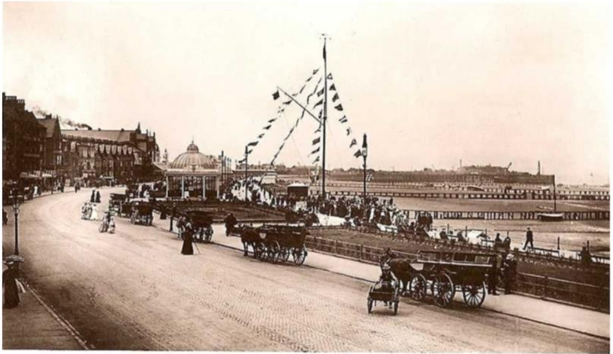
CENTRAL PROMENADE, MORECAMBE.